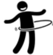
2 Hula hoop